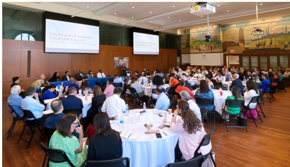
Regional Meeting on Homelessness Draws More than

NMCOG will lead the effort in partnership with the Northern Middlesex Metropolitan Planning Organization (NMMPO) and a Vision Zero Task Force in developing a regional safety action plan titled Northern Middlesex Vision Zero Plan. The Bipartisan Infrastructure Law (BIL) established the new Safe Streets and Roads for All (SS4A) discretionary program, with $5 billion in appropriated funds over 5 years, 2022-2026. Join the Greater Lowell Vision Zero mailing list to receive project updates and event notices.